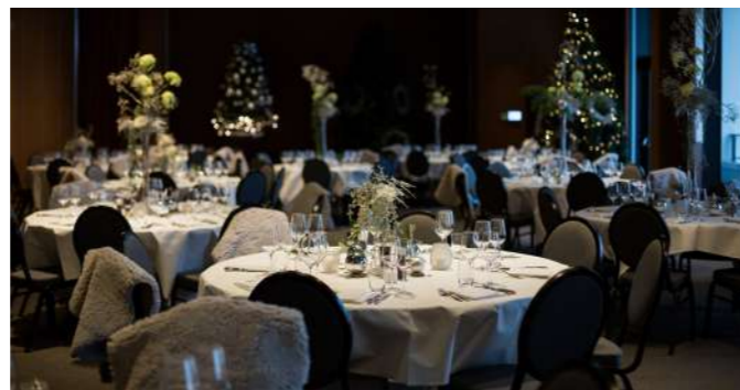
Seminar, team building, conference, cocktail, product presentation, training, business meal... Solutions for all your needs!